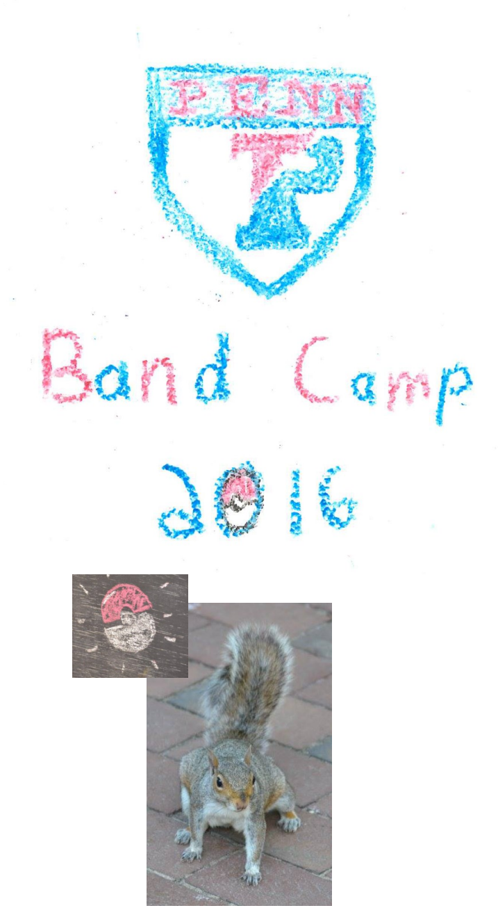
A wild Rattata has appeared!