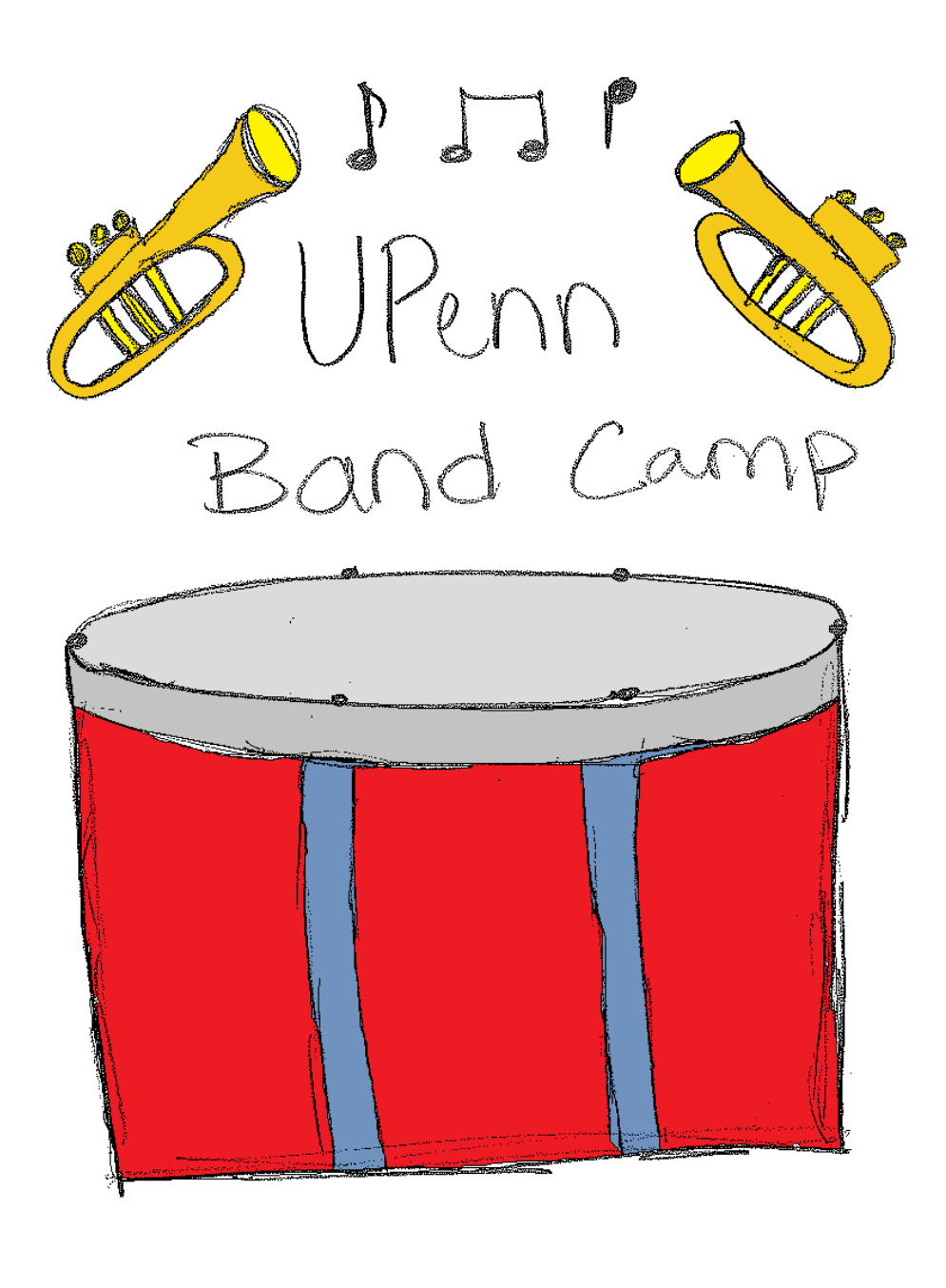
End of Program Concert